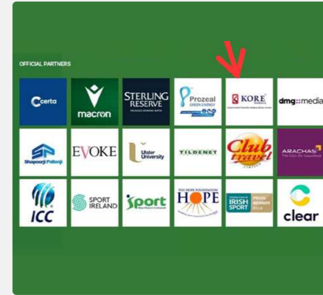
→ Press Release – Kore Mobile-India's Fastest Growing Mobile Retail Chain, Partners with Cricket Ireland: