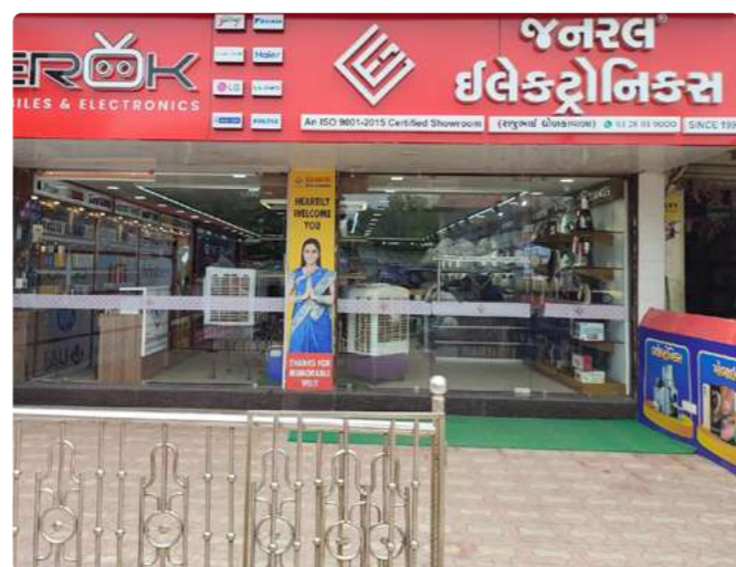
→ General Electronics