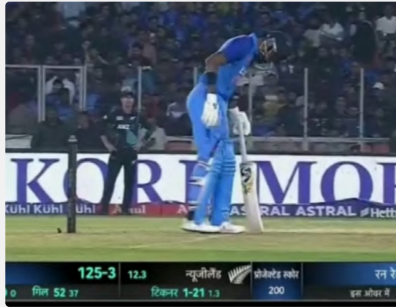
→ Cricket Stadium Advertisement IND vs NZ

The Company has taken the help of various social media platform like Twitter, Instagram, WhatsApp, Facebook, Aids in cricket matches, Print Media, Official Partner of the Ireland Men's Cricket Team during India Tour of Ireland T20 Series 2023, etc. for reaching the people across all demographics. The idea to have touch with people aimed at adding and associating more customers with our Company.