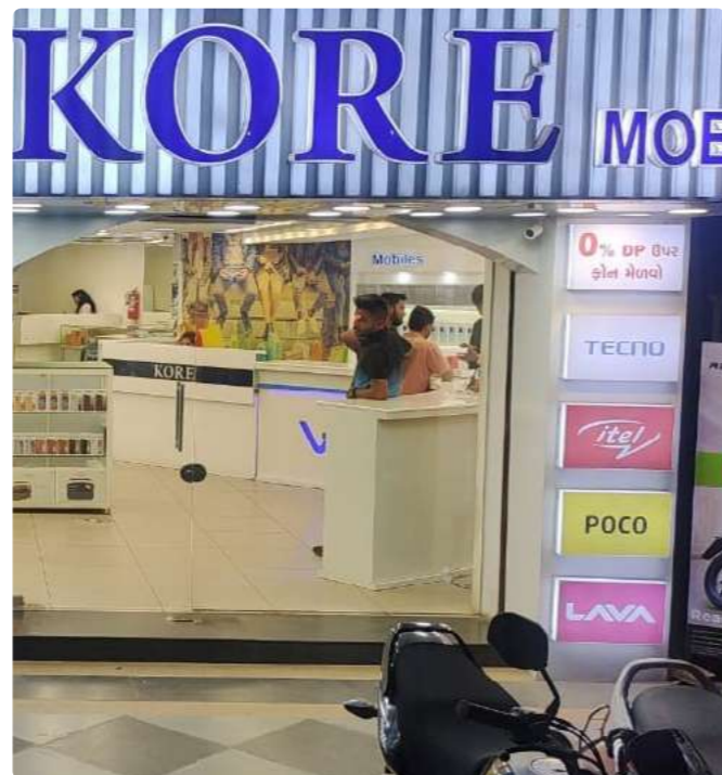
→ Kore Store