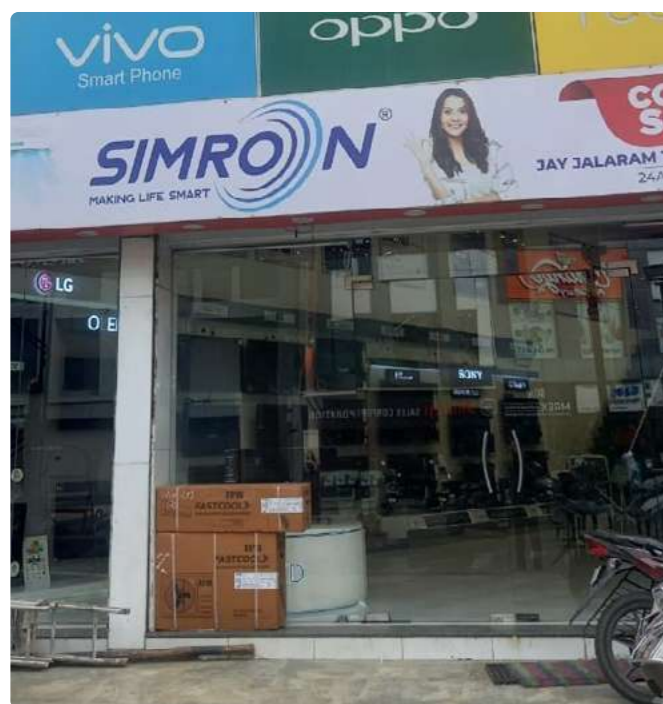
→ Simron Store