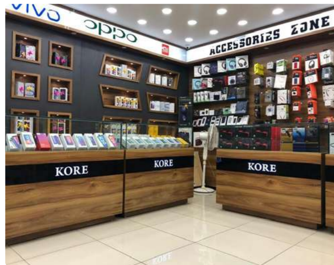
→ Kore Store