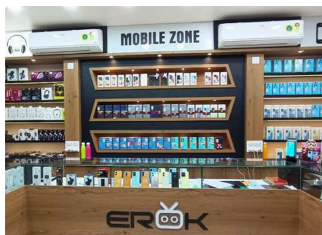
→ Erok Store